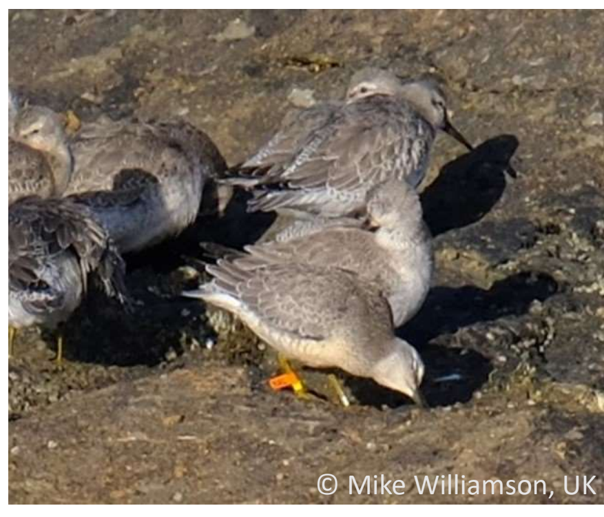
OfY HAL, September 2020, Aberlady Bay, Scotland