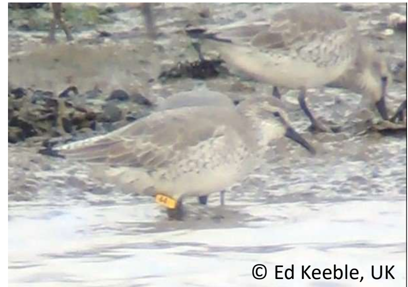
Yf 44, Stour Estuary, Essex, UK