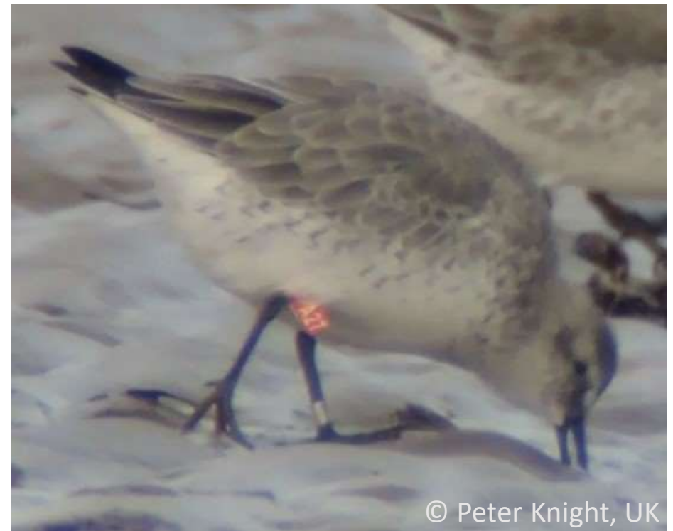
Y+Rf A05, July 2020, Fanø, Denmark