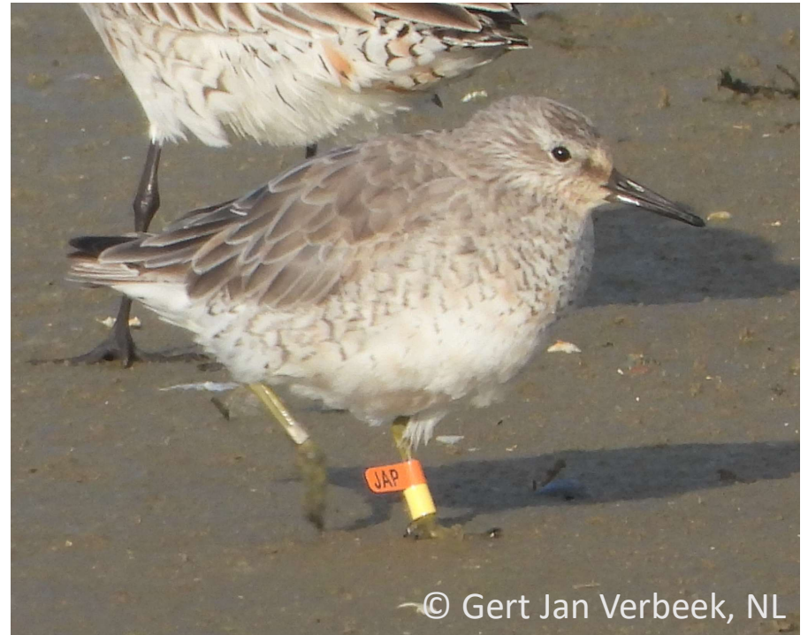
OfY HAL, September 2020, Aberlady Bay, Scotland