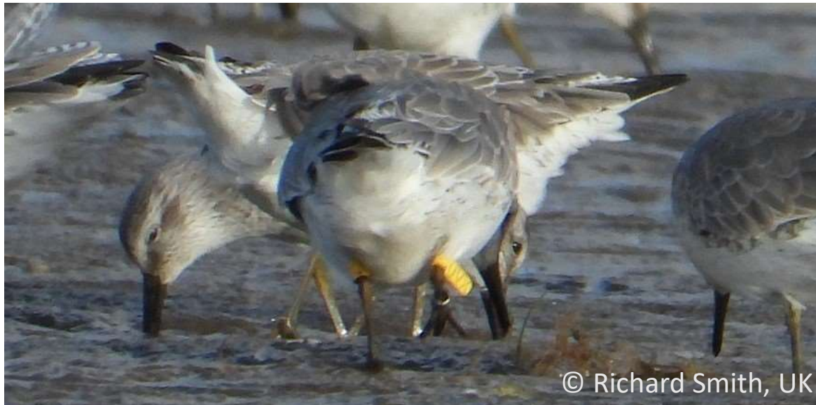
Yf UVX, November 2020, Dee Estuary, Cheshire, UK