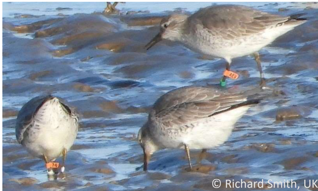
OfP 74 and OfG AEV, March 2020, Meols, Cheshire, UK