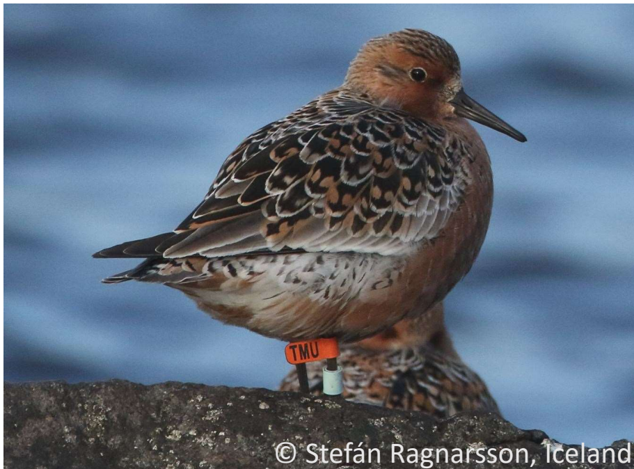
OfP TMU, May 2022, Reykjanesbær, Iceland