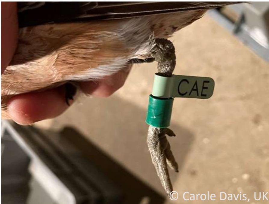
LfG CAE newly ringed, August 2020, The Wash, UK