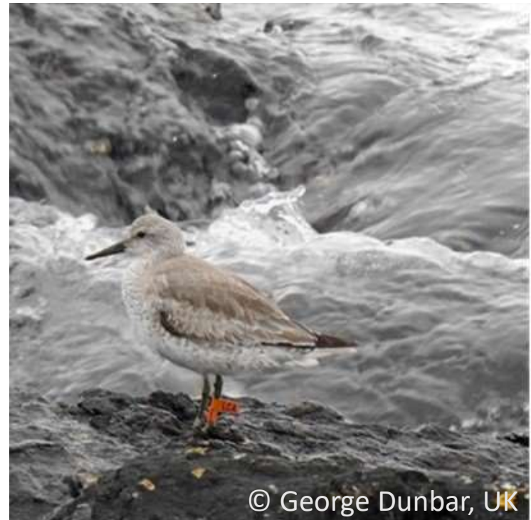
OfO LCA, May 2020, Bardsey Island, Wales