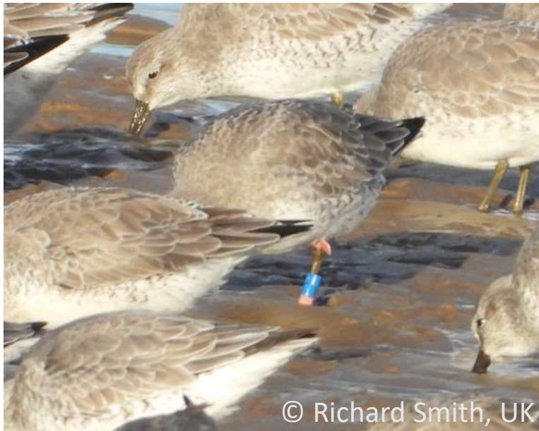
Dec 2020 Dee Estuary, Cheshire, UK