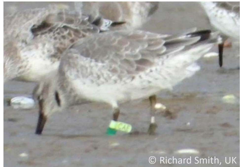
LfG CAE in the field, November 2020, Dee Estuary, Cheshire, UK