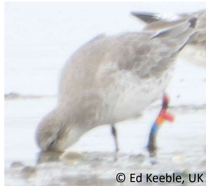
© Ed Keeble, UK R-RfOB, Oct 2020, Stour Estuary, Essex, UK