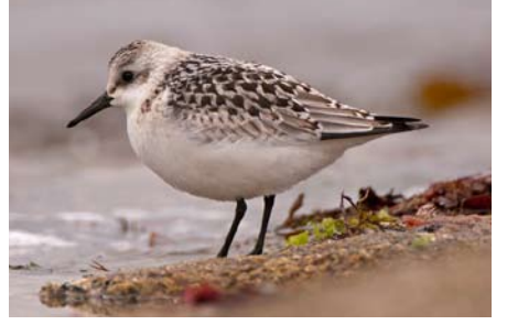
1 Mid-Sep., Brittany: Typical plumage before start of moult. The mantle feathers and scapulars with black centers and white fringes are distinctive. The buffish tinge at neck and face indicates a very fresh plumage.

usually moult their head and body feathers. Tertials and wing coverts are only moulted in birds wintering in the tropics.