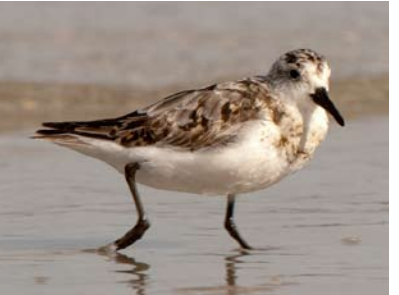
4 Mid-Sep., Brittany: Moulting from breeding to winter plumage. The fresh looking grey feathers in crown and scapulars are the winter plumage feathers. The dark ones are left-overs from the breeding plumage.

Adults undergo a complete moult replacing their breeding plumage with a plain grey and white winter plumage.