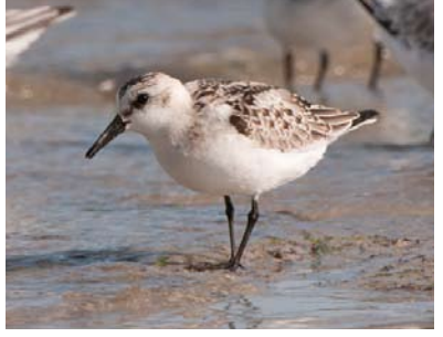
2 Mid-Sep., Brittany: Crown and side neck are smudgy black. Some of the mantle feathers are already moulted into winter plumage.