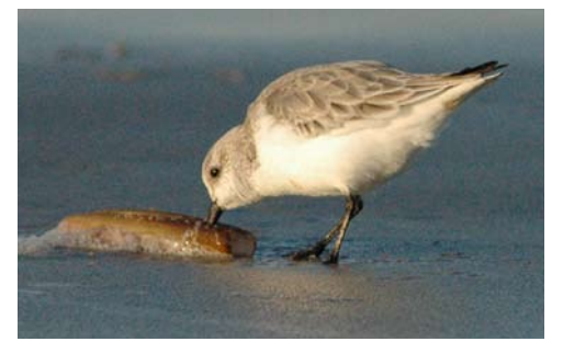
6 January, North Frisia: Full winter plumage showing the typical plain greyish upperparts and shining white underparts.