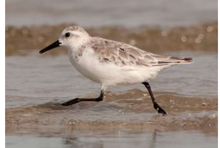
5 Mid-Sep., Brittany: Almost completely moulted into winter plumage. Only very few black feathers are left on the upperparts.